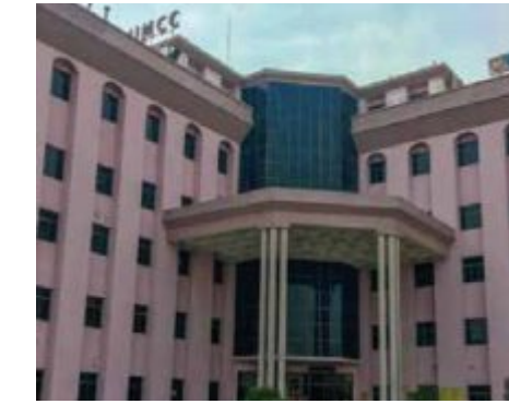
Usha Mallapudi Hospital < 05 mins