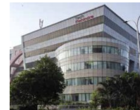
Tech Mahindra < 21 mins.