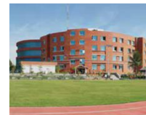
Ambitus World School < 30 mins.