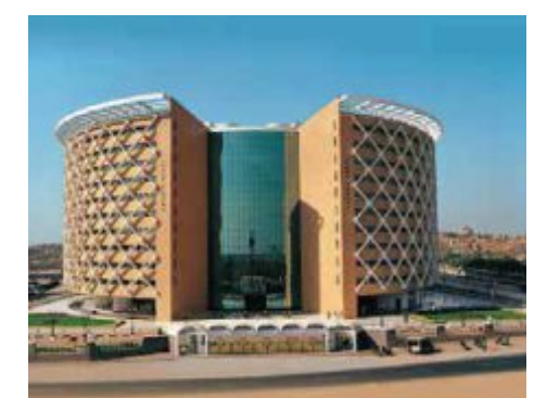
Hi-Tech City < 35 mins.