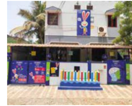
Euro Kids School < 05 mins

Gajularamaram is an excellent choice for those who wish to reside in a tranquil ambience and at the same time want to reach out to the city life. The locality has easy access to amenities and transport links to various parts in the city. The area retains a suburban charm and has several reputed hospitals and colleges.