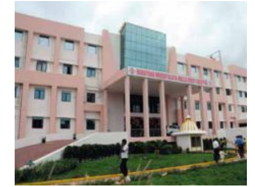
Malla Reddy Hospital < 10 mins.