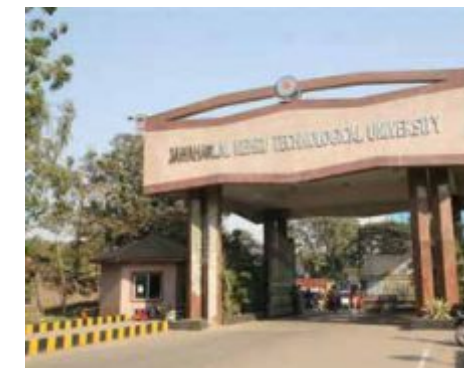
JNTU Kukatpally < 15 mins.