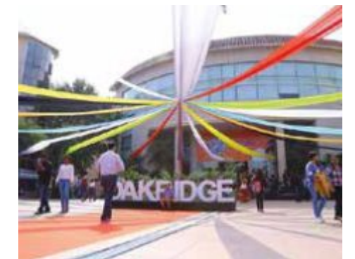
Oakridge School < 20 mins