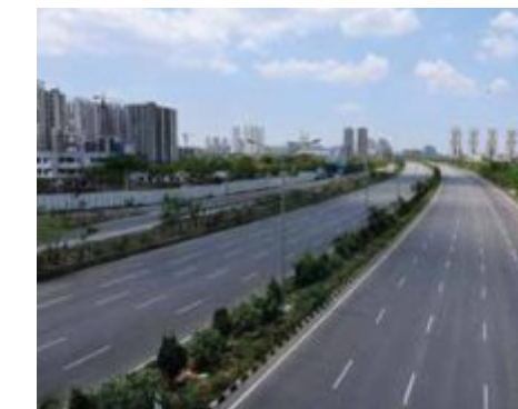
ORR Exit #5 < 20 mins